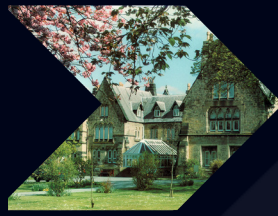
LISTED BUILDINGS & OF HISTORICAL INTEREST