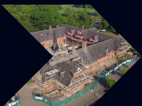
REFURBISHMENT & REINVIGORATION ENGINEERING